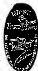
Mexico 5¢ 1 of 138