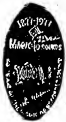
U.S. 5¢ 1 of 3