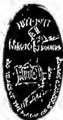
U.S. 1¢ 1977D 1 of 10