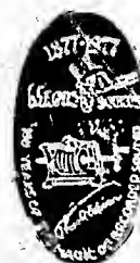
Mexico 5¢ Silver Plated 1 of 6