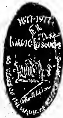
U.S. 1¢ 1977 1 of 34